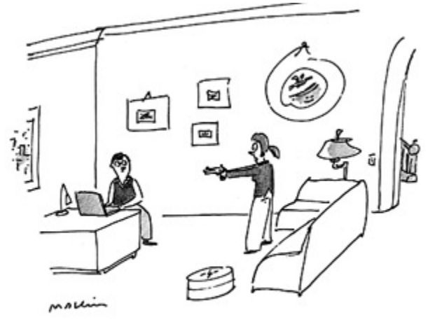
"O.K., step away from the laptop and hold up your end of the conversation."

Opening. Begin a talk by introducing yourself by name, even if you've just been introduced —unless you've received an unusually long and clear introduction. The session chairs who introduce people at conferences often garble the names or fail to use the microphone. People are finishing off conversations while the chair introduces you. The people in the back of the room probably didn't hear the introduction, even if it sounded clear to you.