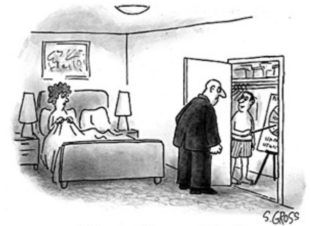
"I can explain everything."

Second, examine your unconscious belief that the purpose of slides is to remind you what to say. Once upon a time, speakers prepared index cards. Today, speakers project their index cards (as a list of bullet points) and make their audiences read them. Please understand that this is a hostile act. Go back to index cards. Some presentation programs let you write notes that appear only on your laptop screen.